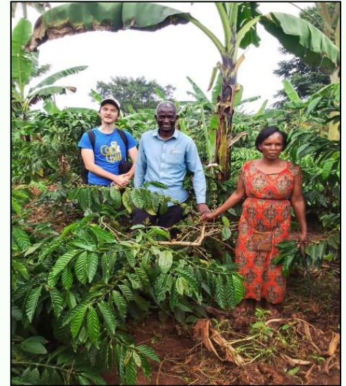
The director of WHC Uganda and his wife set the leading example with their coffee gardens

children and improve their overall standard of living. This shift marks a significant step towards sustainable economic development in the area.