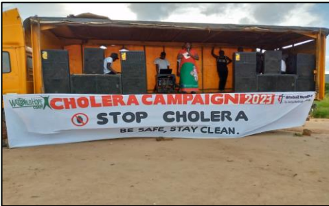
Hired van with public system used as a stage to conduct cholera campaigns

During the first quarter of 2023, WorldHope Corps Malawi implemented a cholera prevention program in three areas 25km away from Mzuzu. The proposal was developed and submitted to the United Methodist Global AIDS Fund in the USA. The program involves both preventive measures and water treatment interventions and is set to run for 4 months from March 1 to June 30, 2023.