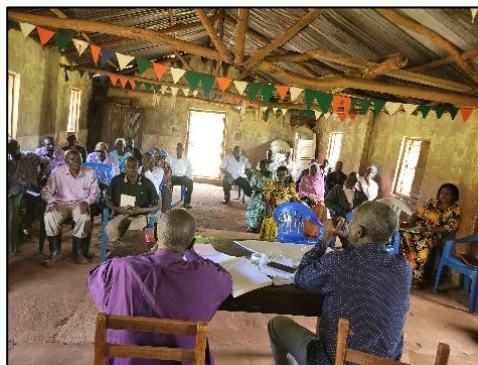
Shalom Coffee training in session

A coffee training was conducted and a Muslim representative from the Salaam Coffee Cooperative was invited to advise participants on growing, harvesting, and storing quality coffee that can compete on the international market. The representative also encouraged members to join the Source of the Nile Shalom Cooperative to benefit from marketing and additional training opportunities for their coffee. Several new members registered for membership in the cooperative.