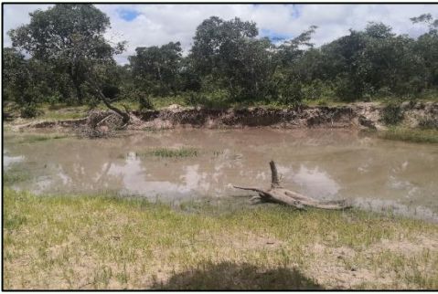
Current source of water for the people in Nkosi village—a muddy pond