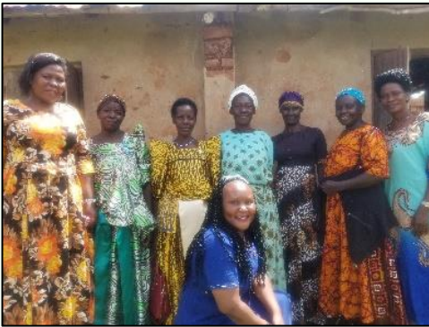
Some members that received loans

These women are grateful for the efforts that the friends and partners of WorldHope Corps are making to help them achieve their dreams of becoming self-sufficient.