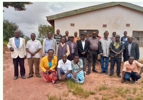
Group Village headmen who are fully in support of the cholera project

than 2,500 people out of the 5,000 targeted for the whole project, and have contributed to a significant reduction in the number of cholera cases in the area. The program also has increased community awareness and knowledge on cholera prevention, reduced cholera transmission cases, and improved hygiene and sanitation practices in the community. The program has received support from 22 village chiefs and group headmen who are encouraging community members to attend and learn from the cholera campaigns taking place in their areas.