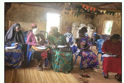
Participants of the Marketing Training

Participants were provided with lunch and a small transport allowance. The training aimed to equip the women with the necessary skills to market their products effectively and improve their business profitability.